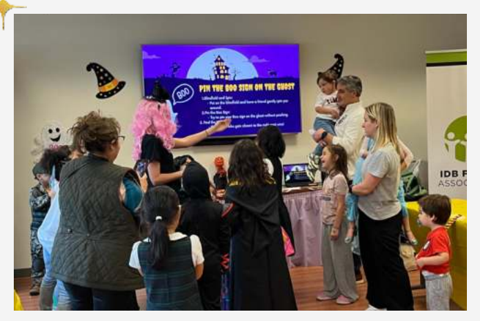
We had a Spooktacular Halloween event in October where the children played, danced and created together. A nice opportunity to make new friends.