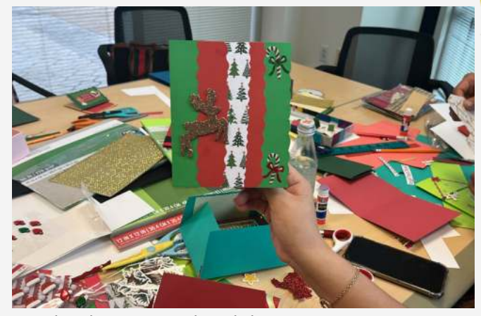
The Christmas card workshop was an invitation to creativity, where each fold and sparkle became unique expressions of affection to celebrate the magic of the holiday season.