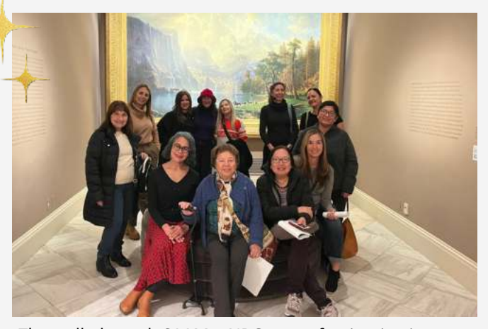
The walk through SAAM + NPG was a fascinating journey for this group of passionate professionals and art enthusiasts, immersed in a sea of knowledge and inspiration.