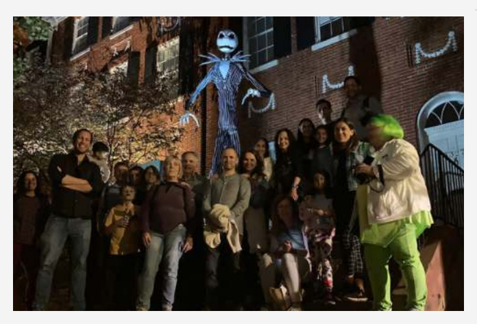
Between haunted stories and mysteries, Halloween revealed its magic as we explored the unknown through the streets of Georgetown during the Ghost Tour.