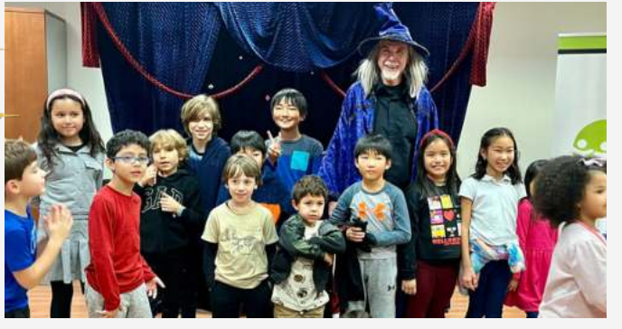
An end of the year celebration with the children. A magician enchanted the guests with fascinating tricks, while around him, smiles illuminate everyone's faces.

In this year 2023, we, at the Family Association, had the honor of offering you, our members, unique opportunities to strengthen ties, learn, make friendships and share experiences. We hope that in 2024 we will remain united and with a calendar full of new activities.